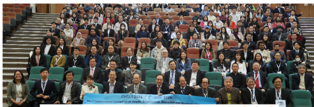
WRE 2024 GROUP PHOTO