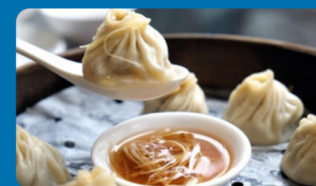
XIAO LONG BAO