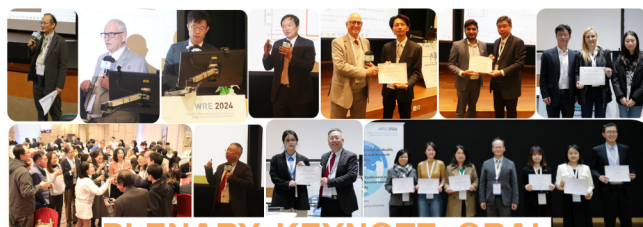
PLENARY, KEYNOTE, ORAL PRESENTATIONS & AWARDING